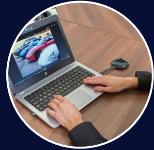
Connect to CleverCast with one tap