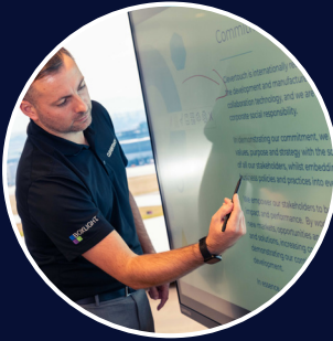
Collaboration Tools at your fingertips