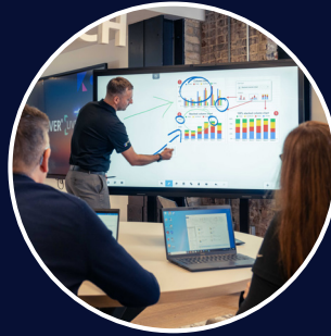
Enhanced Boardroom Collaboration